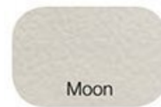
Ultraleather® Seating Choice