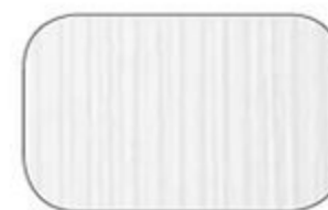
Angel White Texture Upper Doors (optional)