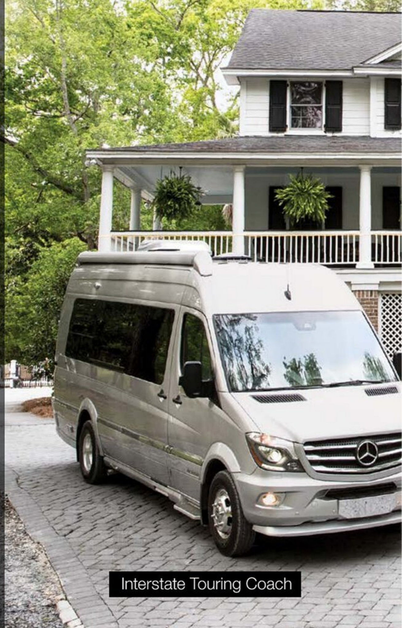
Interstate Touring Coach