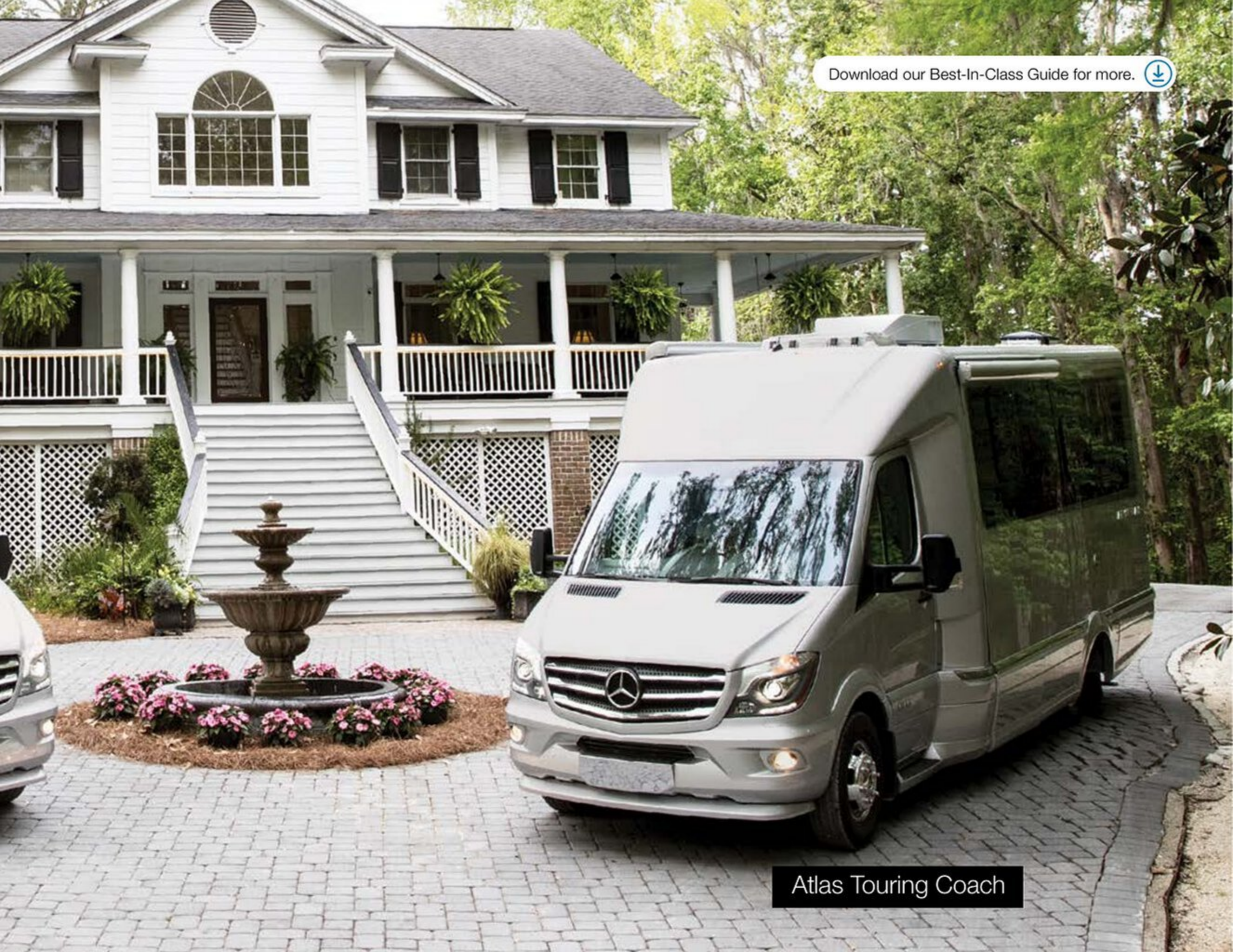
Atlas Touring Coach