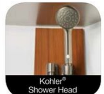
Kohler® Shower Head