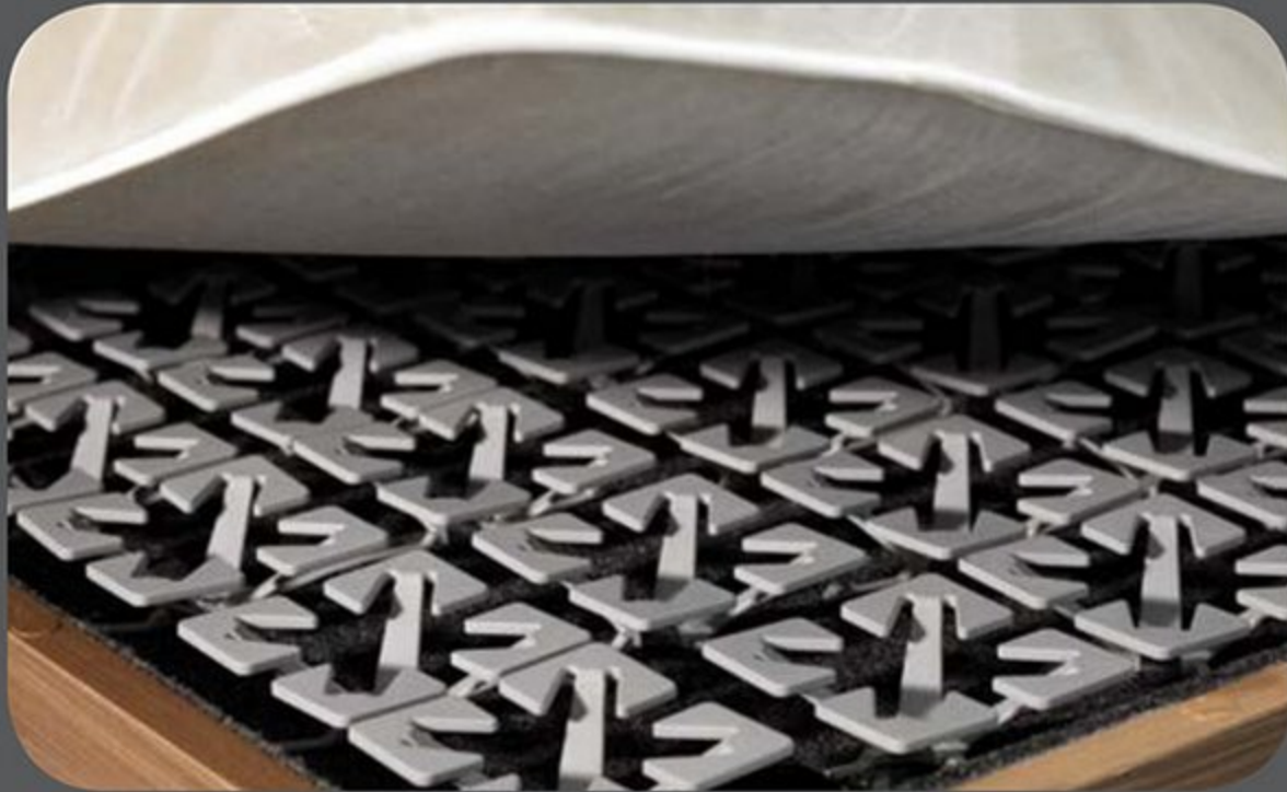
Froli® Ergonomic Bed System