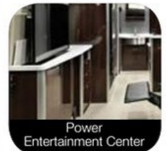
Power Entertainment Center