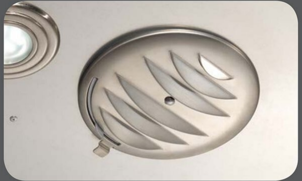
Quietstream™ Ducted Air w/Heat Pump