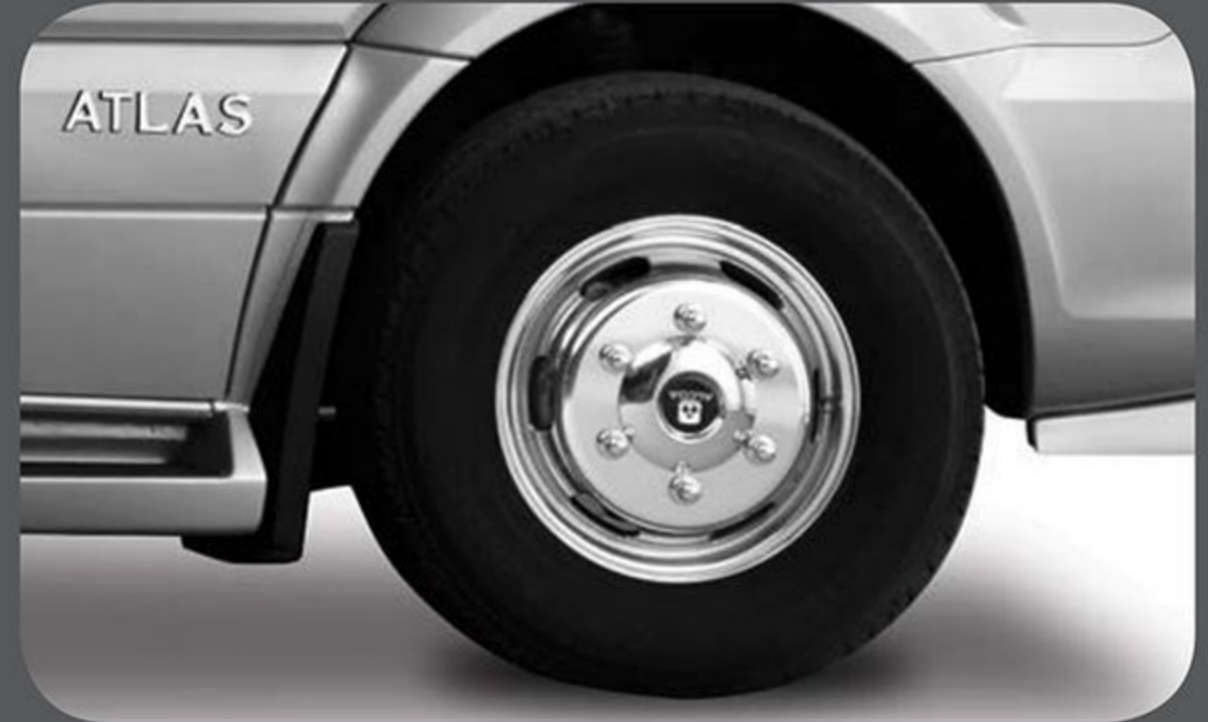
Alcoa® DuraBright Aluminum Wheels