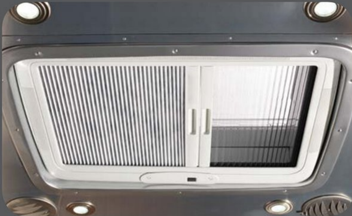
Power Opening Sunroof w/Screen & Shade