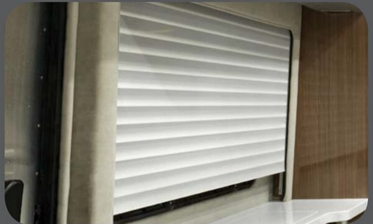
Power Tilting Oceanair Window Shades