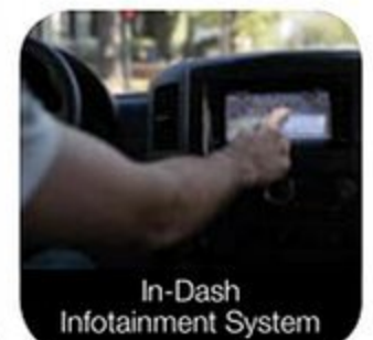
In-Dash Infotainment System