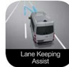
Lane Keeping Assist