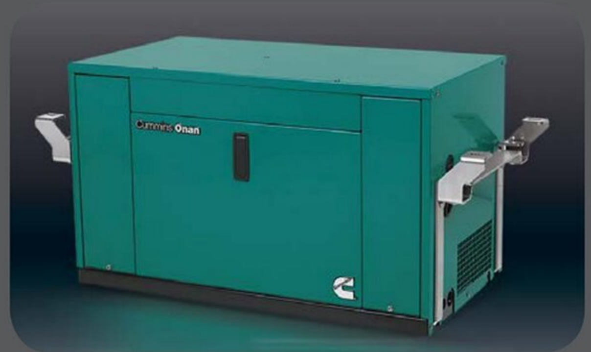
3.2kw Onan® Quiet Diesel Generator