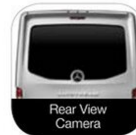
Rear View Camera