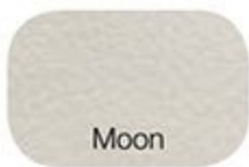
Ultraleather® Seating Choice