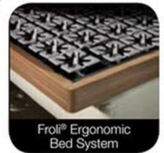
Froli® Ergonomic Bed System