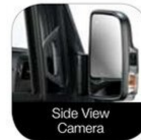
Side View Camera