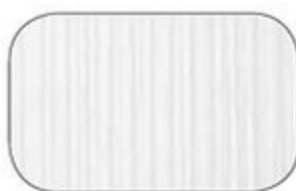
Angel White Texture Upper Doors (optional)