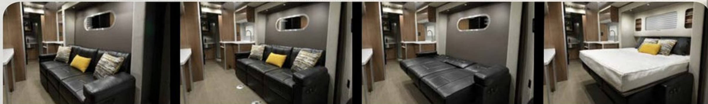
Go from lounging to sleeping with ease, on the Villa® power sofa with integrated Murphy bed.