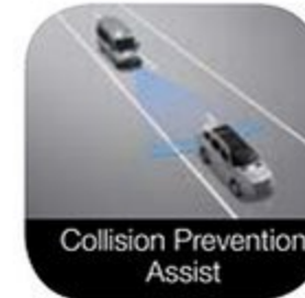
Collision Prevention Assist