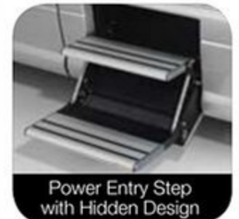
Power Entry Step with Hidden Design