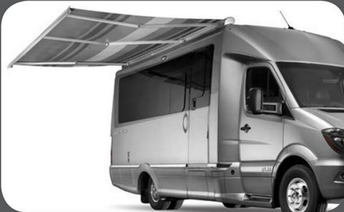
Power Armless Awning w/Auto-Retract