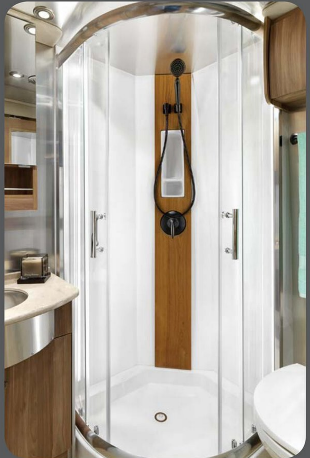
Matte cabinetry pairs beautifully with the teak shower inlay.