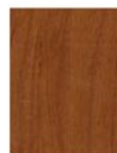
WINDSOR GLAZED CHERRY