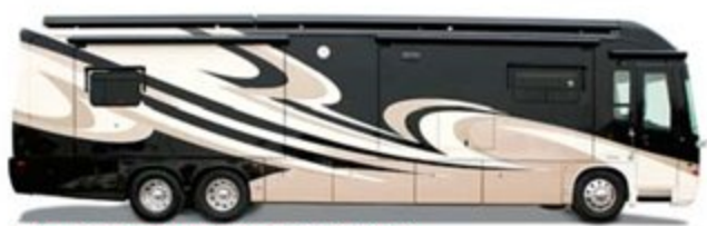
WHITE DIAMOND PEARL