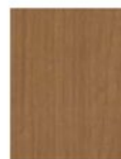
TUSCAN GLAZED CHERRY