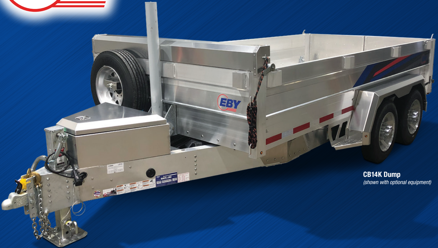
CB14K Dump (shown with optional equipment)