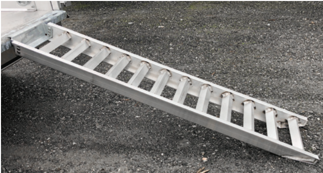
High-strength aluminum pull-out ramps are much lighter and easier to reposition than steel