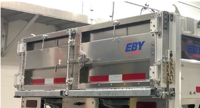
Robust barn door tail gate with secure door hold backs (Shown with optional 2-way spreader gate)